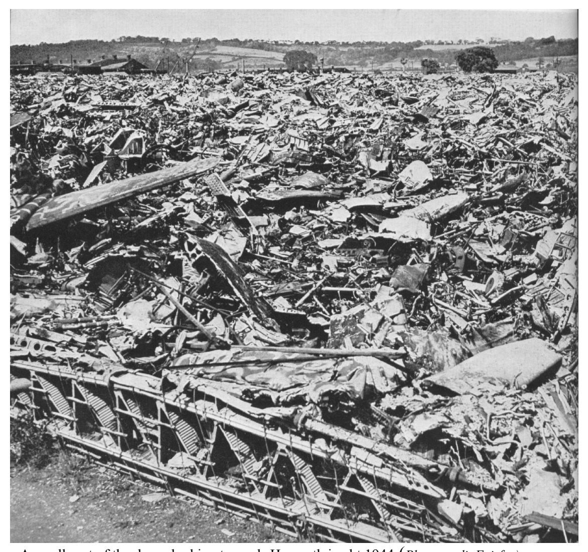
A small part of the dump looking towards Horspath in abt 1944

Some 70 years ago, the land now occupied by BMW and some of the adjoining local farmland now threatened by developers for a new housing estate, was the site of the largest crashed aircraft dump in southern England during WW2:-